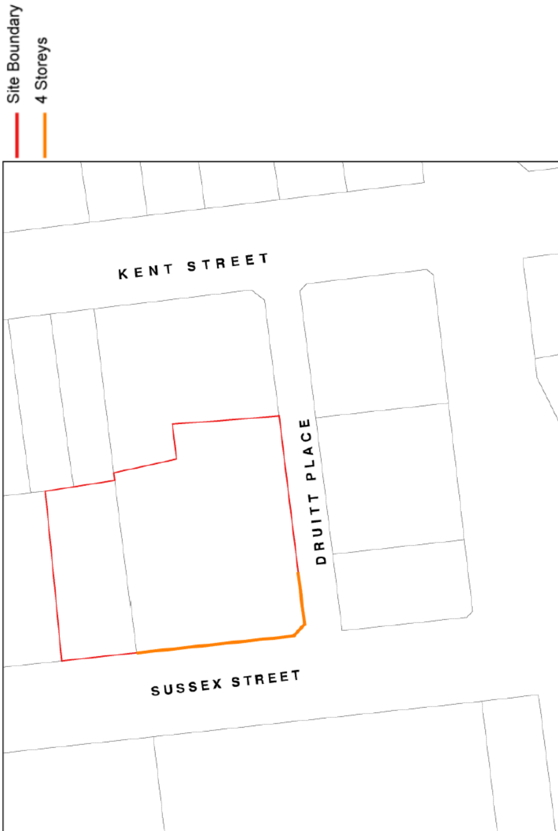
Figure 6.x: Street Frontage Height